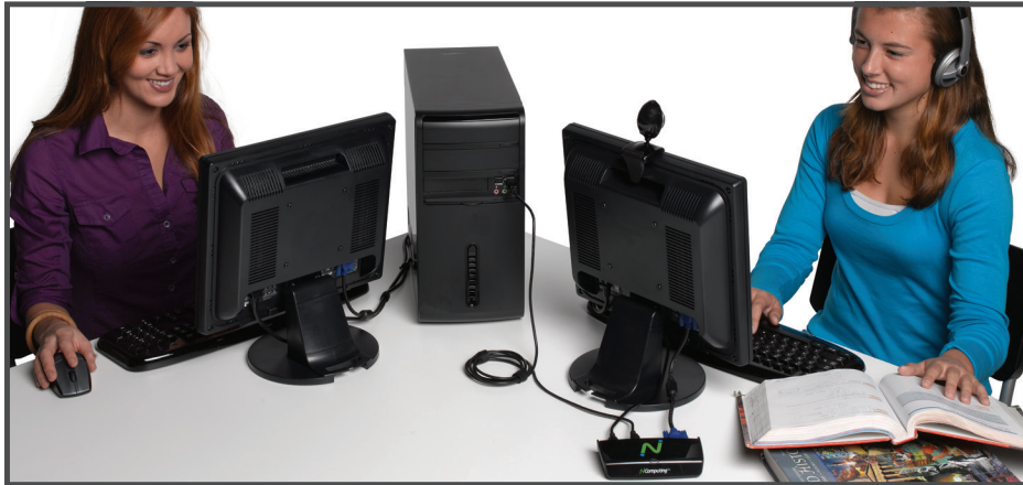
The U170 is ideal for classrooms, public access, small business, digital signage, and home use.

Desktop virtualization does not have to be complex. Or expensive. Unlike other desktop virtualization solutions, NComputing does not need expensive and complicated servers and infrastructure. In fact, vSpace was designed to efficiently share the normally wasted CPU cycles in standard low-cost PCs. In an NComputing solution, vSpace creates multiple virtual workspaces in one physical computer, and then the additional users connect their monitors, keyboards, and mice, through a simple access device. With the U170, connecting the access device to the shared computer couldn't be easier: just snap them together with the included USB cable.